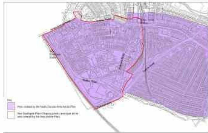
Map 9.9 New Southgate Place Shaping Priority Area