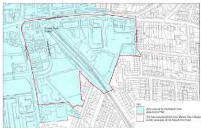
Map 9.7 Enfield Town Station Place Shaping Priority Area