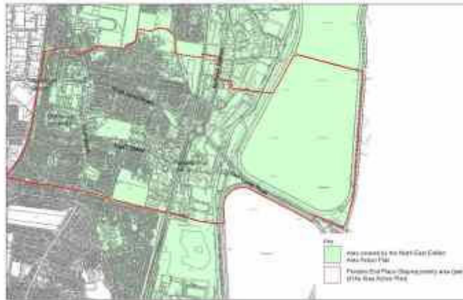
Map 9.5 Ponders End Place Shaping Priority Area